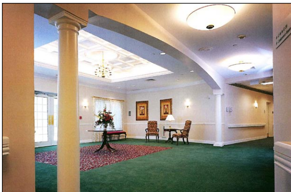
Main Entry Lobby